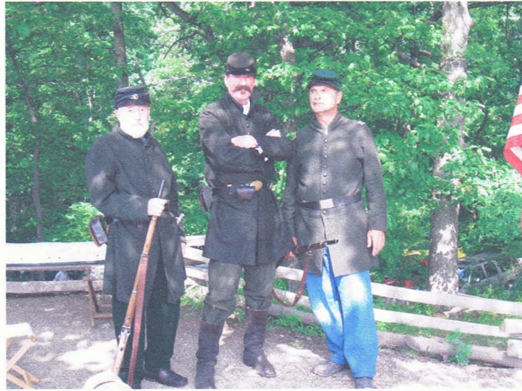
3 of the original defenders of "Little Round Top"

Hey it's a new year! Now it's time to have some fun!